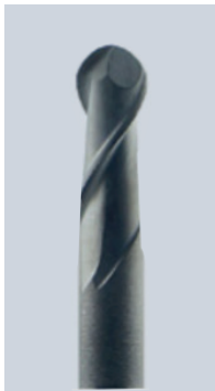
Diamond Carbon (DC)